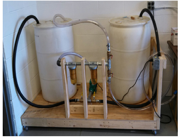
Figure 2. WVO filtration

The system is designed to remove impurities from the WVO and moisture before future processing to biodiesel. It consists of taking the heated, strained oil and pumping it through two filters. The first filter is a 15-micron water block that is designed remove water from the oil, while the second filter is a 10-micron filter that is designed to take out dirt and impurities in the oil (Figure 2). This process will be run twice so that will be able to produce a better overall biodiesel.