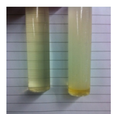
Figure 4. A passed 27/3 test using ultrasonication (left) and a failed test using conventional stirring (right)

In the 20-gallon chemical tank, the methanol and lye were mixed to produce the sodium methoxide. This reaction is exothermic, which produces heat, and results in the formation of sodium methoxide. In the first step, the sodium methoxide was added to the WVO in two stages. First, the oil is reheated between 118^{\circ} - 126^{\circ} F ( 120^{\circ} F is optimum), and 80% of the sodium methoxide was added. The mixture was maintained at this temperature and mixed for one hour using a circulating pump and the ultrasonic transducer.